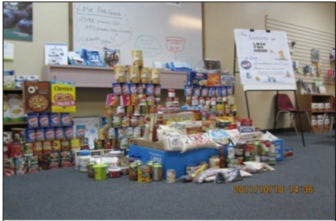
Thanks again, Stevie and Weight Watchers!